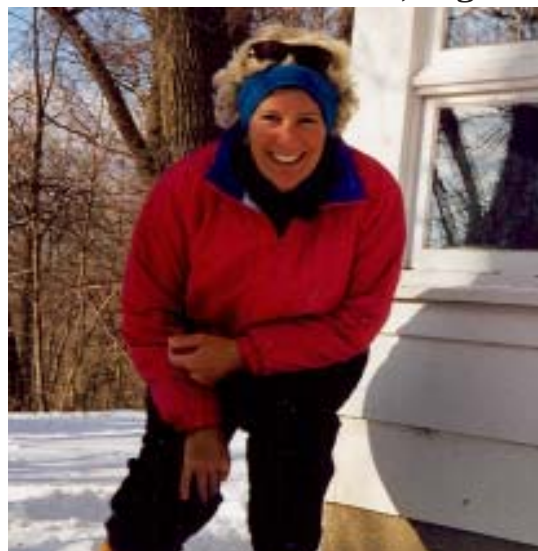
Eleven-time national champion Caprice Behner