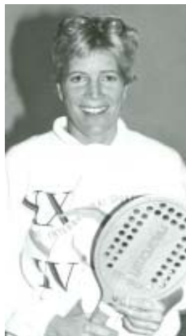
Caprice: circa 1990

"There were some really nice draws in those days and it seemed like the trophy (national) rotated around quite a bit," Caprice said.