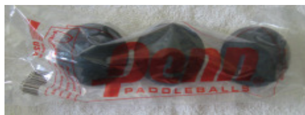
Penn's P-100 paddleball is gone.

Penn last season announced it was halting manufacture of paddleballs to concentrate on its core products of tennis balls and racquetballs.