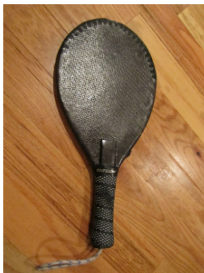
A Pratt Air Paddle.